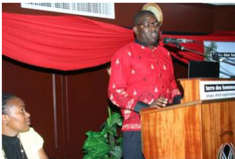
ANPPCAN's Urban Child Trafficking Programme Coordinator addressing participants at the Nairobi Safari Club

Some of the specific approaches that were employed by the programme included community zoning that involved identification of hotspots in the targeted communities that served as collection, transit and endpoints for trafficking of children. The programme, then, proceeded to map out key actors and mounted an integrated and multi-sectoral approach with focused interventions that serve the priorities of targeted children and actors at various levels of the community, county and national levels.