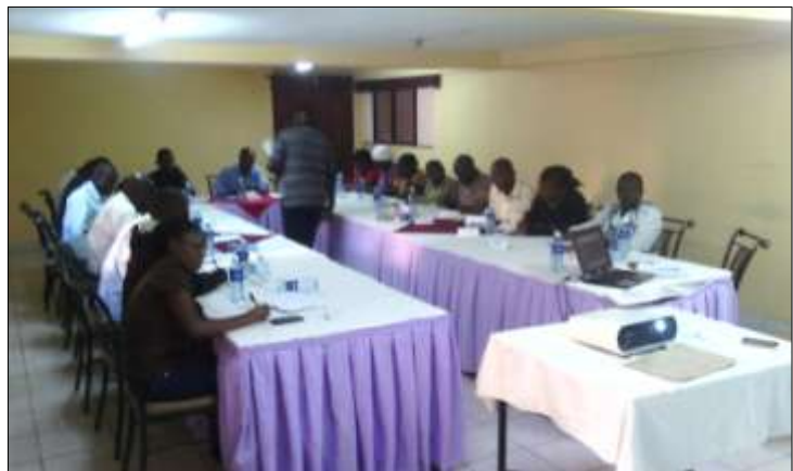
Members of the Embakasi Area Advisory Council in a training on CSEC

In the first case, ANPPCAN with the support of Defence for Children International - ECPAT Netherlands, initiated a programme on Reducing Violence against Children with a special focus on sexual exploitation of children that was implemented in Embakasi Sub County and in the larger Nairobi County. The programme was informed by ANPPCAN's work on Quality Improvement on Community Child Protection Systems project supported by the University Research Co. LLC (URC) in 2013 in Embakasi and Dagoretti sub counties in Nairobi where community