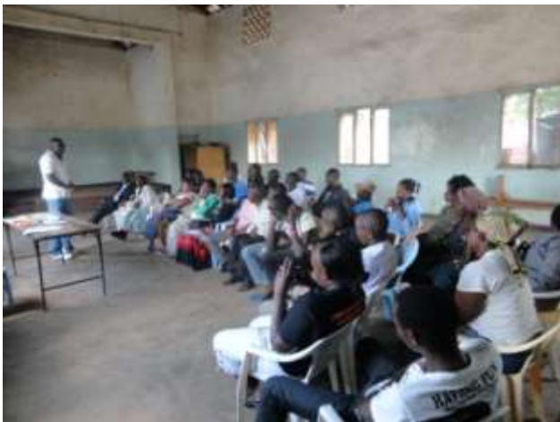
A training for the Embakasi Area Advisory Council. A Sub Committee on SEC was formed to spearhead CSEC activities in the Sub County.

To strengthen collaboration on sexual exploitation of children, several child rights clubs were reached with some of their representatives participating in focused group discussions and community conversations. ANPPCAN mobilized children who participated in celebrating the 2014 Day of the African Child through the child rights clubs. Children who participated and had been sexually abused were offered free counseling services by the Eastern Deanery AIDS Relief Programme (EDAP). Some of the children who needed further help were referred for medical checkup and support.