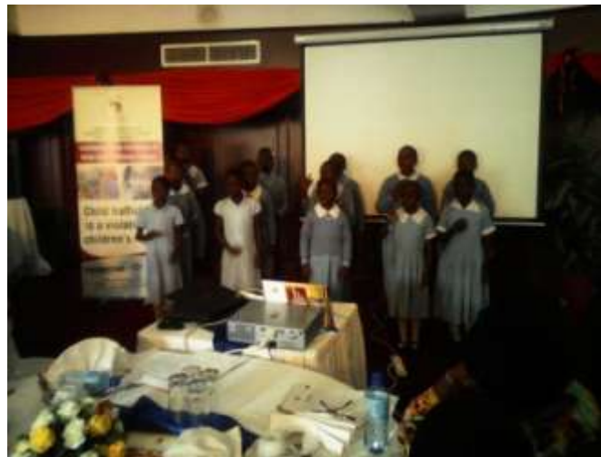
Children participate in a forum to launch the Urban Child Trafficking Programme at the Nairobi Safari Club

In the two projects, ANPPCAN mobilized community members, including children, to participate in anti-child trafficking and anti-commercial sexual exploitation of children activities, as a way of encouraging ownership and sustainability of the activities. This was ensured through the strengthening of community structures both at Nairobi County and at the National level, as a long-term measure in tackling child trafficking and CSEC in Kenya.