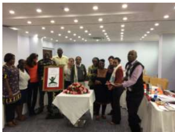
Representatives taking part in three regional forums to strategise on CSEC issues in the East Africa region

ANPPCAN took part in three regional forums on Violence against Children with a focus on sexual exploitation of children held in Addis Ababa, Ethiopia. The first meeting was hosted by ECPAT France where issues of Commercial Sexual Exploitation of Children were discussed and an action plan on engaging stakeholders in the region was developed. A second follow-up meeting took place in October. Discussions in the second meeting centred on a global research on Commercial Sexual Exploitation of Children, which Kenya is part of. The third meeting was that of the African Union Committee of Experts that was held in November. The members of the Committee met to input into the new Strategic Plan of the Committee of Experts.