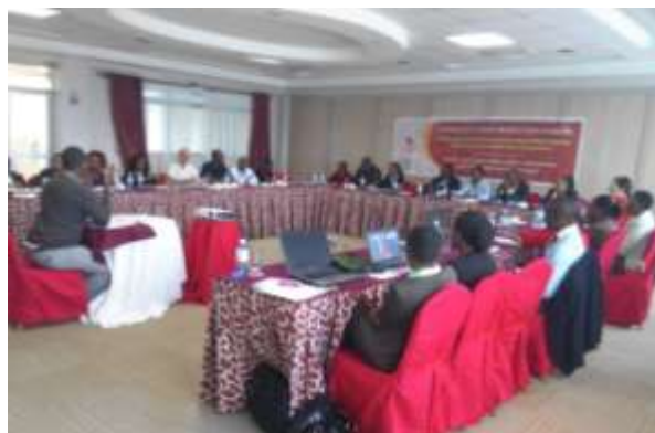
Members of NCPT in a meeting. An evaluation of NCPT was conducted to strengthen the Team in responding to CAN

The sector working groups of the Nairobi Child Protection Team, namely the psychosocial, medical and legal aid continued to hold quarterly meetings to address issues of concern and give feedback on cases of child abuse handled within the network. Notable issues in the sector working groups included: sharing success stories and challenges, strengthening interventions in the provision of services to children, sharing data and information, assessing the trends of child abuse and neglect and the effectiveness of response, custody and maintenance, access to justice among others. The three sector groups held their meetings as scheduled with the psychosocial group holding three (3) meetings, the Legal aid holding two (2) meetings while the medical group had one (1) meeting in the year.