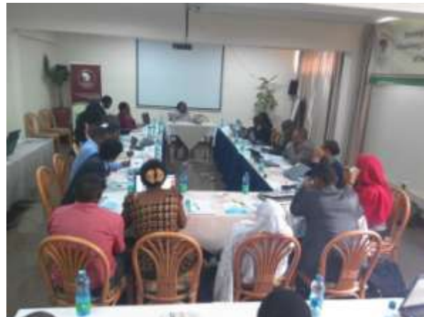
A review and planning meeting for members of the Technical Working Groups on National Child Protection Systems in Nairobi in progress in Nairobi

The meeting was attended by 27 members drawn from six Technical Working Groups (TWGs) in Ethiopia, Kenya, Tanzania, Sudan, South Sudan, Uganda and Rwanda. During the meeting, participants appreciated the importance of collaboration between the TWGs and key government ministries such as security (mainly the Police), health, education, justice and civil society organizations in establishing and operationalising the National Child Protection Systems in the region.