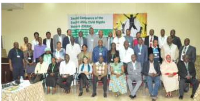
Delegates who took part in the Second Eastern Africa Child Rights Network Meeting in Kigali, Rwanda

The meeting established the structures of the network – the General assembly, the steering committee as well as extended the mandate of the current secretariat. ANPPCAN represented at the meeting by the Communications Officer.