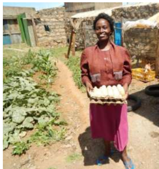
One of guardians of the children in the Sponsorship programme is empowered in poultry farming

Five of her children have benefited from the Education programme which graduated her to the