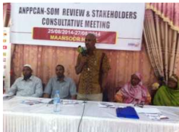
ANPPCAN Somali Annual Conference in progress. The Chapter reviewed progress made in 2013 and also adopted the Strategic Plan and M&E Framework

The second day of the Conference was a thanksgiving session where the Chapter recognized actors from the government, the civil society and the private sector for helping the institution to reach where it is currently. The third day was spent reviewing the policy documents of the organization. These included the human resource policy, financial policy procurement and management manuals. The staff and the board came up with the annual work plans for 2014 and 2015. On the future plans, discussions centred in making the Chapter more sustainable by developing a business arm to mobilize resources beyond donors. ANPPCAN Regional Office was represented at the ANPPCAN SOM Annual Conference by the Director of Programmes.