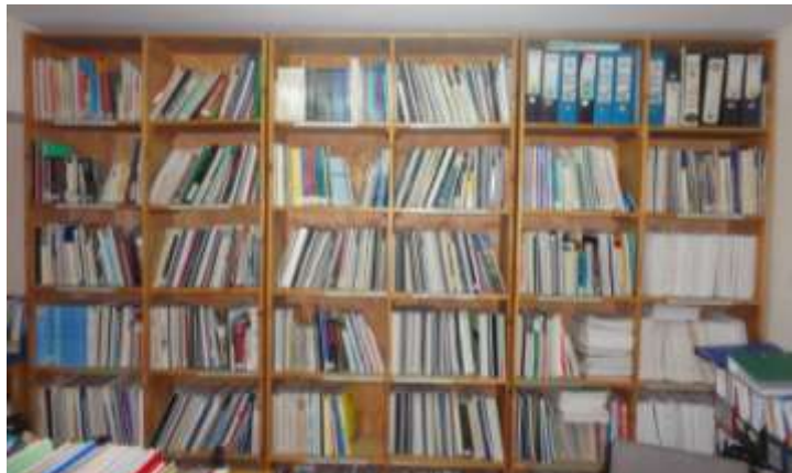
A section of ANPPCAN's Resource Centre: the Resource Centre facilitates sharing of knowledge on child rights and child protection among the child rights community

Inclusions into the library in the year 2014 included specialized children journals, the International Society on the Prevention against Child Abuse and Neglect (ISPCAN)'s Child Abuse Journal, the State of the World Children, Early Childhood Matters, African Renewal and other journals and publications on children. Others include government publications such as the statistical index, the economic survey, policy documents.