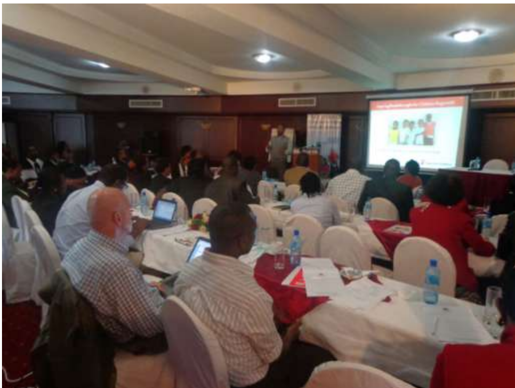
Participants follow proceedings during the National Forum on Violence against Children in Nairobi, Kenya

The forum attracted 200 participants from the state and non-state actors. It was organized by ANPPCAN Kenya in collaboration with the Ministry of Labour, Social Security and Services and the Department of Children’s Services. During the forum, participants held discussions on the impact of corporal punishment as well as the benefits of positive discipline. The Department of Children’s Services used the occasion to launch a report on Ending Violence against Children.