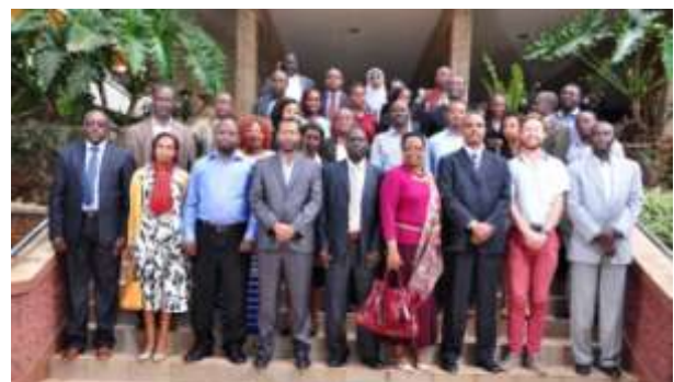
A regional meeting for members of the Technical Working Groups and the Committee of Experts on National Child Protection Systems in Nairobi

The second event that was hosted by the programme was a Review Meeting on Strengthening National Child Protection Systems . The meeting was held in Nairobi, Kenya, in October 2014 and brought together 42 participants from Ethiopia, Kenya, Rwanda, South Sudan, Sudan, Tanzania and Uganda. The purpose of the meeting was to review the status of child protection systems in the seven countries. The specific objectives of the