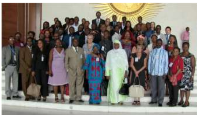
Members the Interagency Group on Child Protection and the Committee of Experts during the 23 rd Ordinary session of the ACERWC

The 23 rd Ordinary Session of the African Committee of Experts on the Rights and Welfare of the Child (ACERWC) was held in April 2014 in Addis Ababa, Ethiopia. The Interagency Group on Child Protection Systems, where ANPPCAN is a member, conducted a training on Systems Strengthening to eleven (11) members of the Committee of Experts and presented a statement on Child Protection Systems Strengthening. The training was meant to increase the visibility, understanding and support for the systems strengthening approach as the best way to prevent and respond to issues facing children in Africa. During the occasion, the Interagency group presented a framework for analyzing State Party reports using a 'systems' lens. This is important because State Party reports provide an overview of the measures they have taken to implement the African Charter on the Rights and Welfare of the Child.