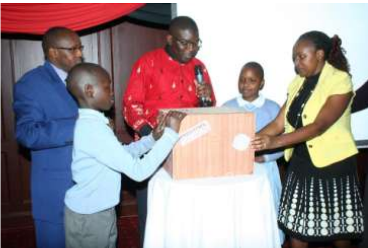
A demonstration on how to rescue a child who has been trafficked during the launch of the Urban Child Trafficking Programme at the Nairobi Safari Club

Most families in the urban communities of Mukuru and Mathare in Nairobi are poor and therefore unable to provide the necessary care and protection for their children. As a result, many children, majority of whom are girls in the two communities, stand the risk of being trafficked into all sorts of situations. For instance, children are moved from their homes to unfamiliar situations and face many challenges, which are detrimental to their growth and development. Often, services provided to such children are highly sporadic and unsustainable.