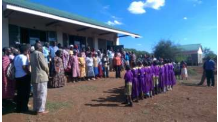
A sensitization meeting for parents on Child Rights and Child Protection at Shokut Primary School in Loitokitok Sub County

The sensitization forum was aimed at increasing awareness and knowledge on child rights and to improve community involvement and thereby enhance participation of parents in child protection activities.