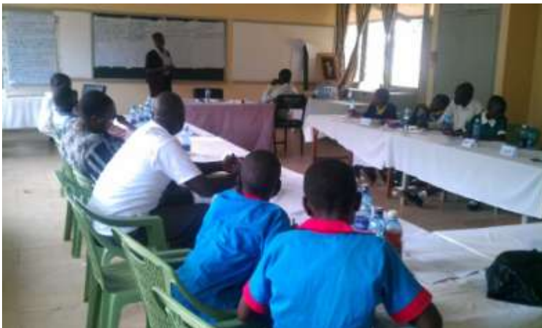
A debriefing meeting for 5 schools exiting from the Child Participation Programme in Busia County in progress

The programme held seven (7) meetings with stakeholders to address emerging concerns on child protection in the two target areas. The meetings were at two levels; firstly, planning meetings for child rights clubs in schools in Busia County and Loitokitok Sub County and, secondly, the cross border stakeholder's meeting involving child protection structures on the Kenya-Tanzania and Kenya-Uganda borders.