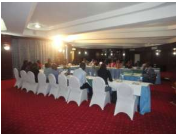
A meeting of the Nairobi Child Protection Team in progress at the Nairobi Safari Club

The Nairobi Child Protection Team (NCPT) held four meetings in the year. The primary objective of the meetings was to continue with discussions on strengthening the referral system for child abuse and neglect and also working together as a team. Key outcomes of the meetings included the proposal for the documentation of NCPT as a good practice for replication in the Eastern Africa region and beyond to showcase how the systems approach to child protection is an effective tool and also show how the system components are implemented in totality, including coordination, data collection, human resource, laws and policies, among others.