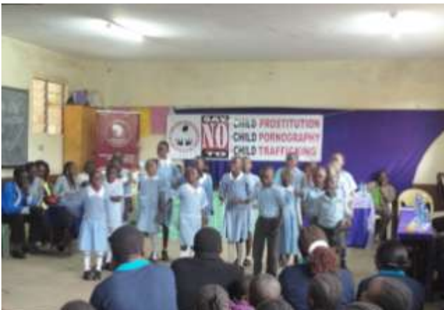
Children at Baba Dogo Primary School, Nairobi, celebrating the Day of the African Child

In the period under review, the programme developed and published 3,000 information, education and communication (IEC) materials comprising of posters, leaflets and stickers for use in campaigning against CSEC. Opinions, views and experiences gathered from children on CSEC through focus group discussions helped in the generation of messages for the IEC materials.