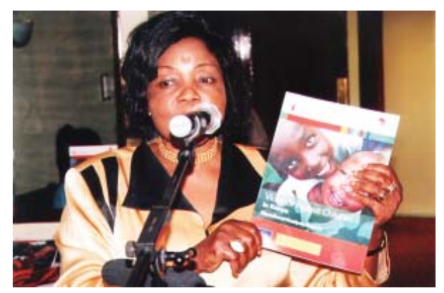
Justice Joyce Aluoch at the Launch of the SitAn

Based on the study findings, the situational analysis recommended the need to build the capacity of actors and implementing institutions such as key ministries, police officers, the magistrates as well as children officers to enable them implement and ensure compliance with the legislation. The purpose of the training was to raise awareness on violence against children amongst the policy makers and government departments in order to generate discussions and home-grown momentum for change in policy and law.